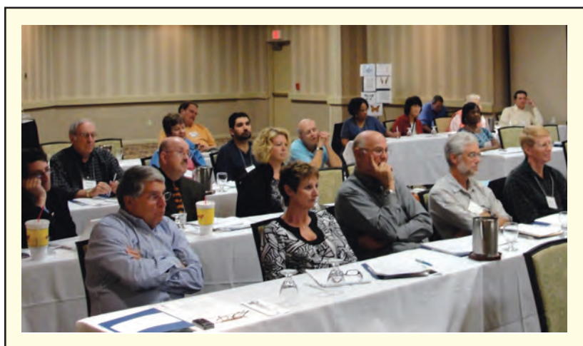
Members listen attentively to a presentation during the Annual Session.